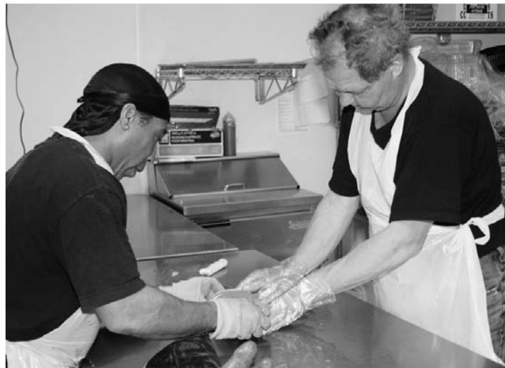
Above: Guests from St. Ben's Community Meal work as holiday production staff for a local Honeybaked Ham store. Guests not only collected a check but were gifted with a ham to share with their own families.

met with me for an hour, I felt that these guys were as committed as I was," he said with a smile. "Now that I have a good source for holiday help, I can look forward to the holidays without feeling like I'll be exhausted at